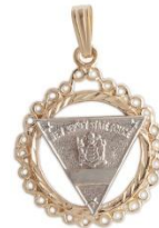
Bezel Badge in two tone Gold