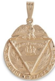
Yellow Gold Pocket Badge