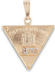
Large Yellow Gold