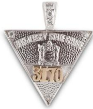
Large White Gold w/ diamonds