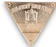
Large Slide w/ bails on back