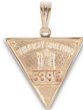
Medium Yellow Gold