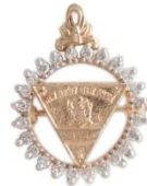
Yellow Gold Diamond pin