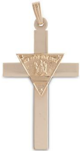
Large Yellow Gold Cross w/ small badge