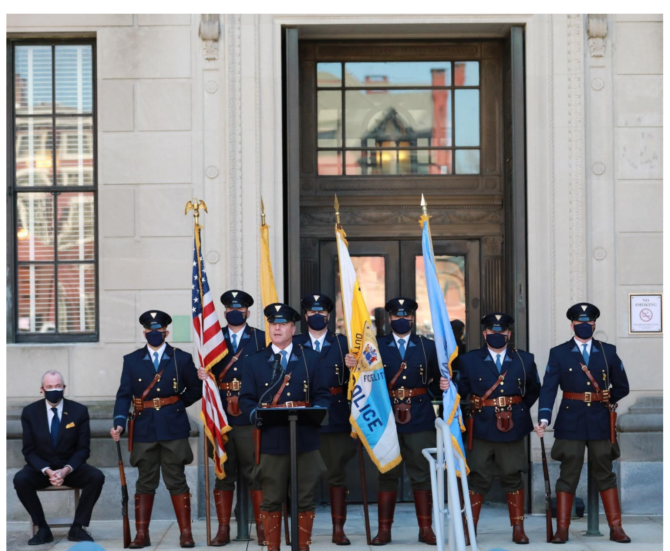
03/29/2021 100th Anniversary

INDEX: 1 - Cover 2 - Colonel's Comments 3 - President's Corner 4 - Editor's Comments 5 - Featured Story 6 - Business Updates 8 - Scholarship Info 9 - Media Matters 11 - FTA Social Events 12 - Health, Security & Misc. Info. 14 - Division Activities 19 - Quarter Century 21 - Last Patrol 26 - Letters to the FTA 31 - Executive Staff 32 - Misc. Forms & Information