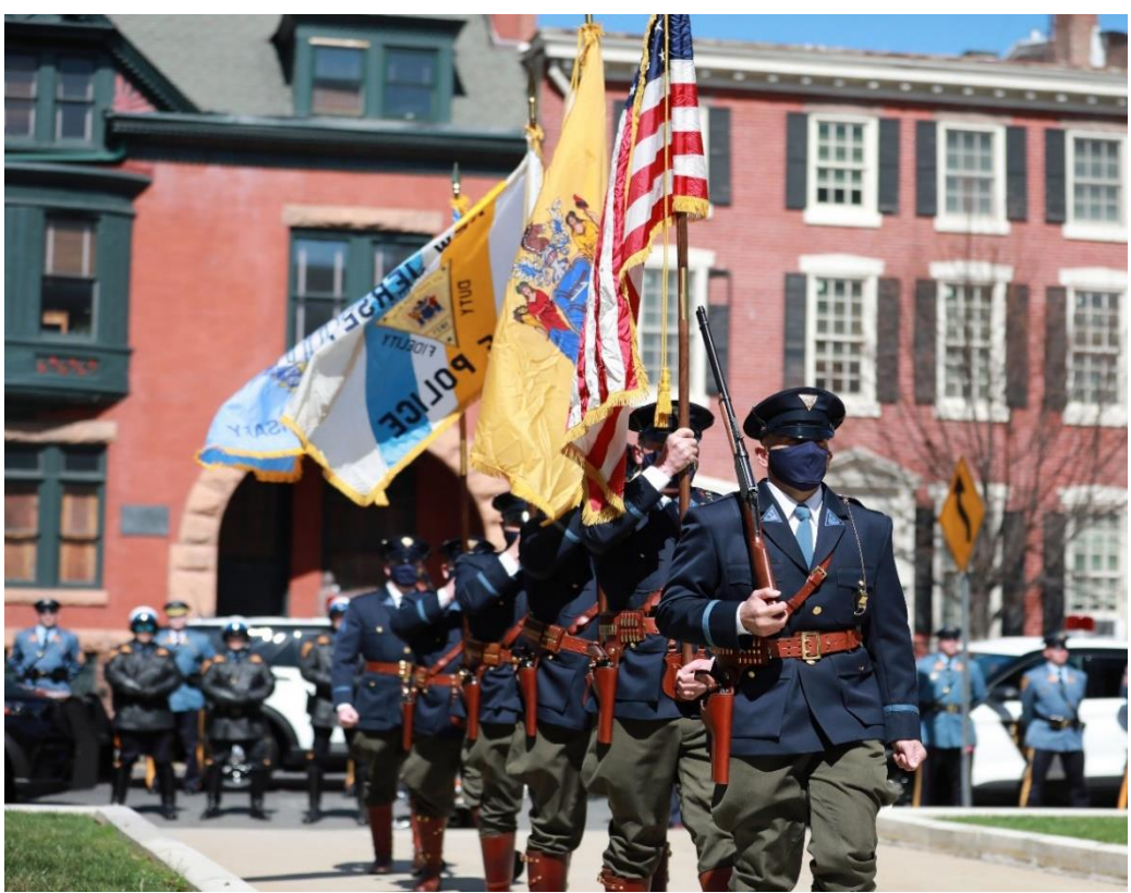
03/29/2021 100th Anniversary