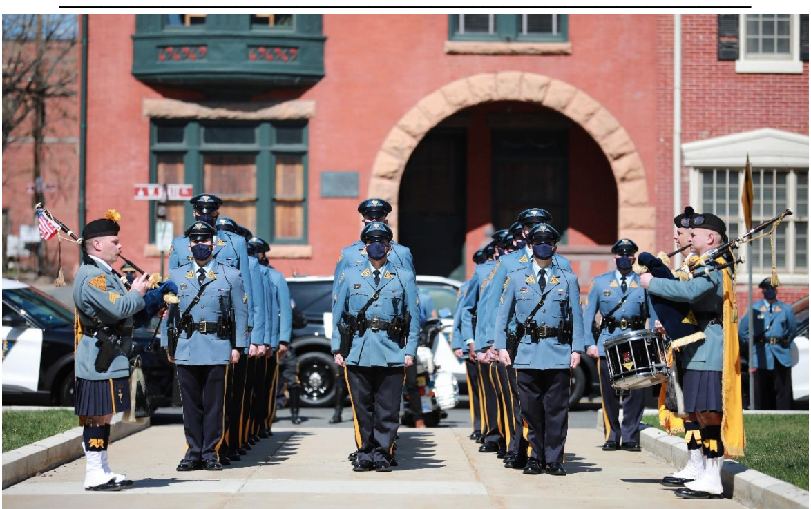
03/29/2021 100th Anniversary