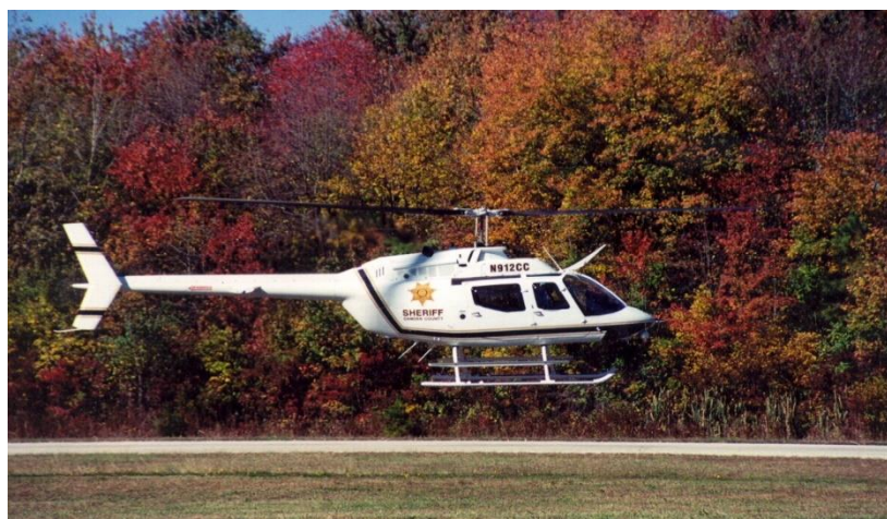
CAMDEN COUNTY SHERIFF DEPT.