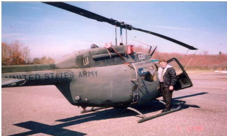
ORIGINAL SURPLUS FEDERAL HELICOPTER