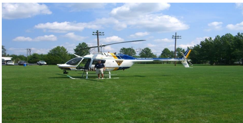
NEW JERSEY STATE POLICE