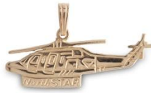
North Star Helicopter