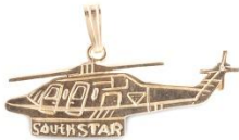
South Star Helicopter