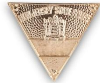
Large Slide w/ bails on back