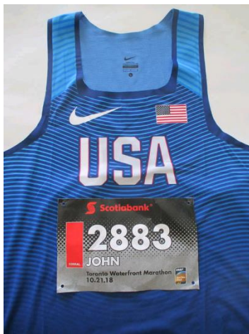
TEAM USA Running Jersey