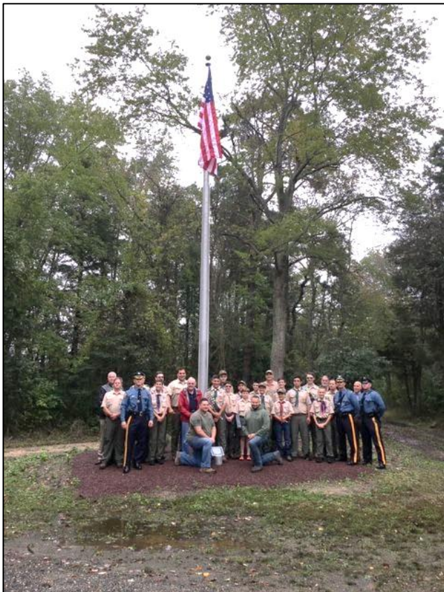
All those who participated in this Flag Raising! visit: https://www.ftanjsp.org/newsletter/FlagRaising.pdf