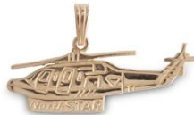
North Star Helicopter