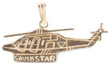
South Star Helicopter