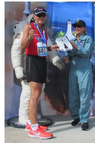
Space Coast 1 st Place Medal