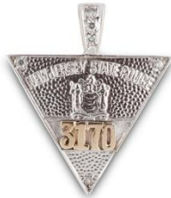
Large White Gold w/ diamonds