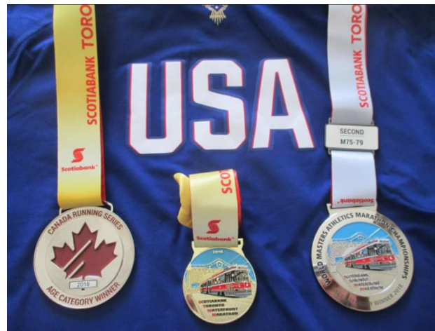
Silver Medal, Scotia Finisher, Silver Masters World Champion