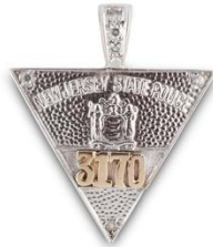
Large White Gold w/ diamonds