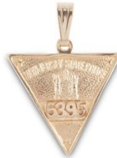
Medium Yellow Gold