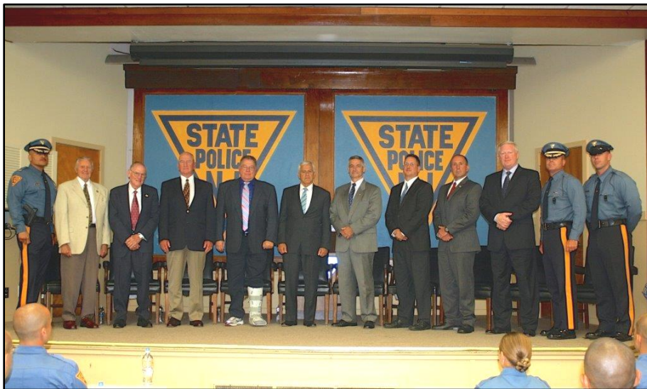
Current & Former New Jersey State Police Academy Commandants