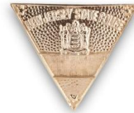
Large Slide w/ bails on back