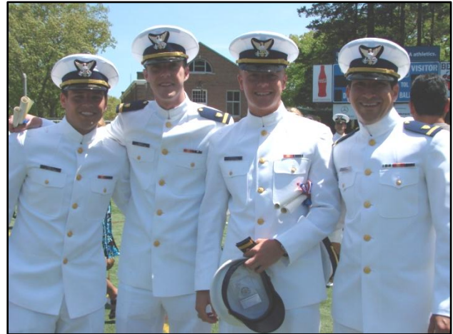
Newly Minted Coast Guard Ensigns