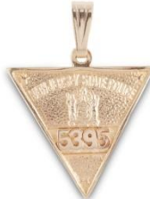
Medium Yellow Gold