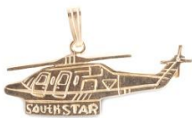
South Star Helicopter