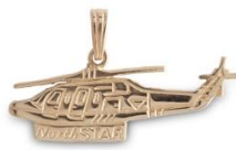
North Star Helicopter