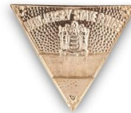
Large Slide w/ bails on back