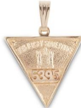
Medium Yellow Gold