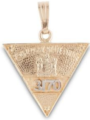
Large Yellow Gold