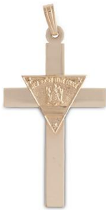
Large Yellow Gold Cross w/ small badge