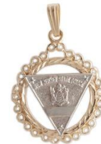
Bezel Badge in two tone Gold