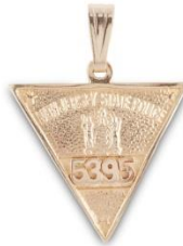
Medium Yellow Gold