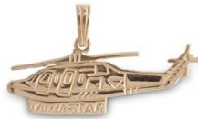
North Star Helicopter