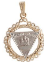
Bezel Badge in two tone Gold