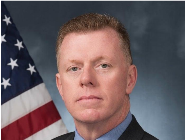
Director James M. Murray