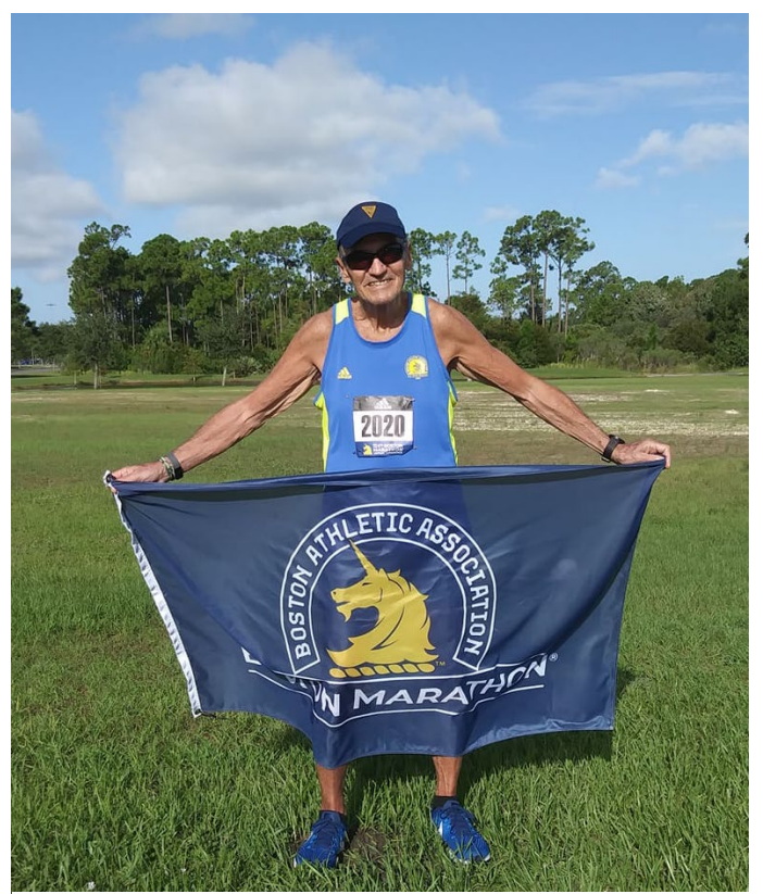
Never in my wildest dreams would I have ever considered running a Marathon in September, in Florida. No less the 124<sup>th</sup> Boston (Virtual). But here I am, completed 26.2 miles early this morning. When GOD gives you lemons, well you do what you do. 9/5/2020

mob running ramshod over our country, using Black Lives Matter and Antifa to instill fear in the citizenry. We will keep you up to date on the outcome of this important legal decision!