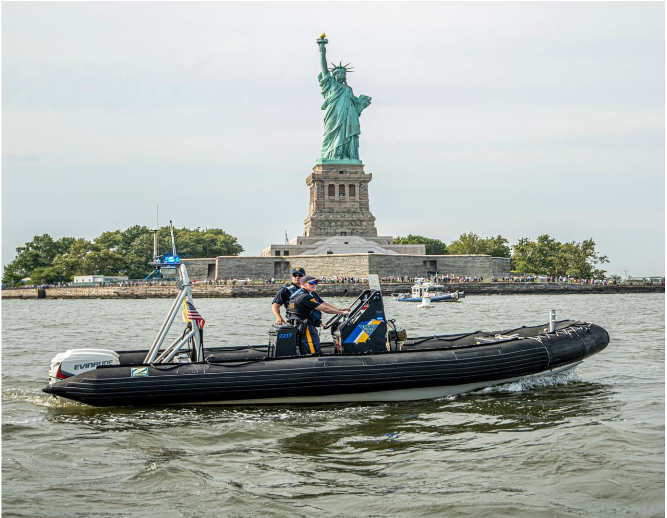
SUMMER 2021 ON THE HUDSON BAY

INDEX: 1 - Cover 2 - Colonel's Comments 3 - President's Corner 3 - Editor's Comments 5 - Spotlight 7 - Featured Story 8 - Military Matters 9 - Business Updates 11 - FTA Social Events 12 - Health, Security & Misc. Info. 15 - Bessie's Corner 17 - Division Activities 21 - Quarter Century 22 - Last Patrol 29 - Letters to the FTA 31 - Executive Staff 32 - Forms & Information